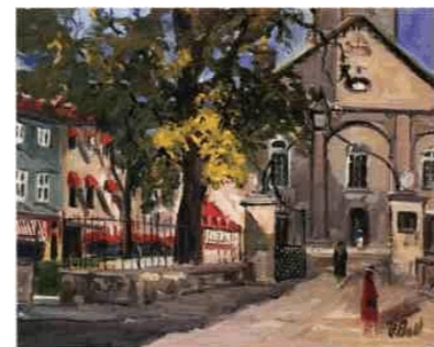
The cathedral close (fenced courtyard)