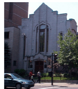
St. John's Lutheran

Location: across the street from accommodation option New Residence and 6 blocks to Victoria College Residence and Diocesan College.